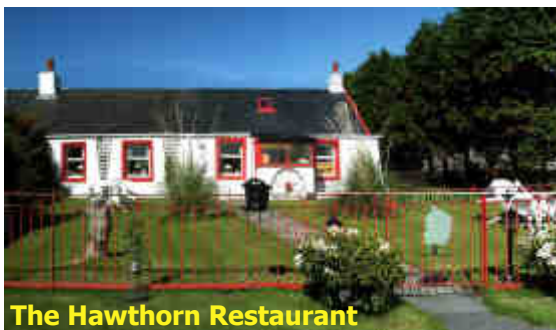
The Hawthorn Restaurant

There is also a small licensed restaurant on the premises