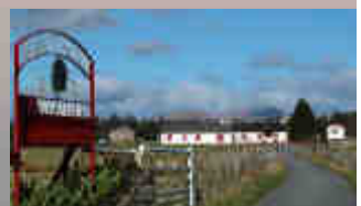
Entrance to Hawthorn