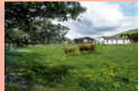
Highland Cattle at Hawthorn